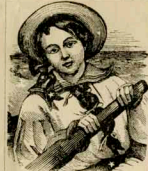
LITTLE ROCK, ARK.