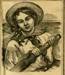
LITTLE ROCK, ARK.